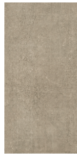
NY04-1224N - Parker 12" X 24" Sq.Ft.: $7.95 - PC.: $15.43