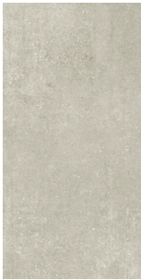
NY05-1224N - Talcum 12" X 24" Sq.Ft.: $7.95 - PC.: $15.43