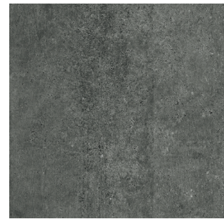
NY06-24N - Shotcrete 24" X 24" Sq.Ft.: $8.95 - PC.: $34.73