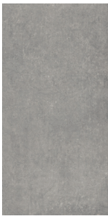
NY03-1224N - Torching 12" X 24" Sq.Ft.: $7.95 - PC.: $15.43