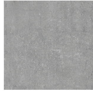
NY02-24N - Portland 24" X 24" Sq.Ft.: $8.95 - PC.: $34.73