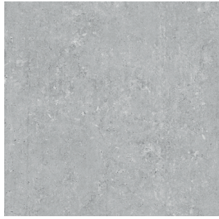
NY01-24N - Quicklime 24" X 24" Sq.Ft.: $8.95 - PC.: $34.73