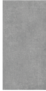
NY02-1224N - Portland 12" X 24" Sq.Ft.: $7.95 - PC.: $15.43