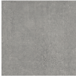
NY03-24N - Torching 24" X 24" Sq.Ft.: $8.95 - PC.: $34.73