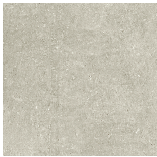
NY05-24N - Talcum 24" X 24" Sq.Ft.: $8.95 - PC.: $34.73