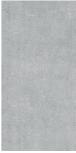
NY01-1224N - Quicklime 12" X 24" Sq.Ft.: $7.95 - PC.: $15.43