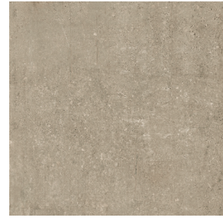
NY04-24N - Parker 24" X 24" Sq.Ft.: $8.95 - PC.: $34.73