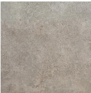
MP03-24N – Block Natural 23.5" x 23.5" Sq. Ft.: $12.95 – Pc.: $50.25