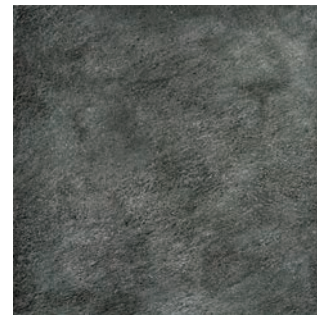
E2MP04-24S – Road Structure 23.5" x 23.5" x 20mm Sq. Ft. $18.95 – Pc. $73.53