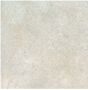
MP01-24N – Square Natural 23.5" x 23.5" Sq. Ft.: $12.95 – Pc.: $50.25