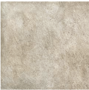
E2MP02-24S – Way Structure 23.5" x 23.5" x 20mm Sq. Ft. $18.95 – Pc. $73.53