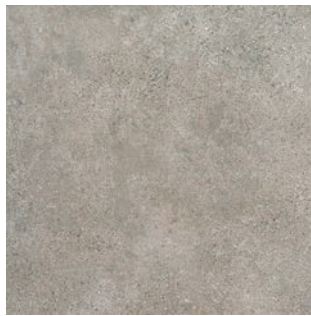
E2MP03-24S – Block Structure 23.5" x 23.5" x 20mm Sq. Ft. $18.95 – Pc. $73.53