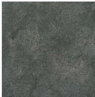
MP04-24N – Road Natural 23.5" x 23.5" Sq. Ft.: $12.95 – Pc.: $50.25