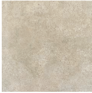
MP02-24N – Way Natural 23.5" x 23.5" Sq. Ft.: $12.95 – Pc.: $50.25