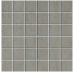
DSFM02 – Lead 2" x 2" – 12" x 12" mesh Sq. Ft.: $24.95 - Pc.: $24.95