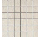
DSFM10 – Milk 2" x 2" – 12" x 12" mesh Sq. Ft.: $24.95 - Pc.: $24.95