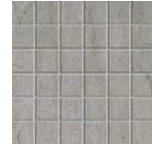
DSFM40 – Grey 2" x 2" – 12" x 12" mesh Sq. Ft.: $24.95 - Pc.: $24.95