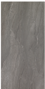
DSF304 – Coal 11.75" x 23.75" Sq. Ft.: $7.50 – PC.: $14.55