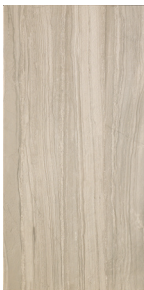
DSF320 – Cream 11.75" x 23.75" Sq. Ft.: $7.50 – PC.: $14.55