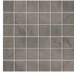
DSFM04 – Coal 2" x 2" – 12" x 12" mesh Sq. Ft.: $24.95 - Pc.: $24.95