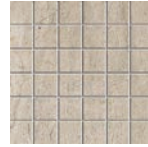
DSFM20 – Cream 2" x 2" – 12" x 12" mesh Sq. Ft.: $24.95 - Pc.: $24.95