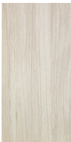
DSF310 – Milk 11.75" x 23.75" Sq. Ft.: $7.50 – PC.: $14.55