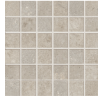
DMPM40R – Cloud 2" X 2" mosaic 11.75" X 11.75" mesh Sq.Ft.: $28.95 - Pc.: $27.84