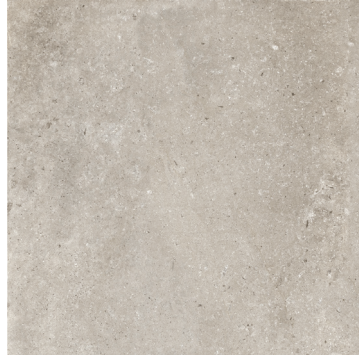
DMP9940R – Cloud 35.5" X 35.5" Sq.Ft.: $12.95 - Pc.: $112.92