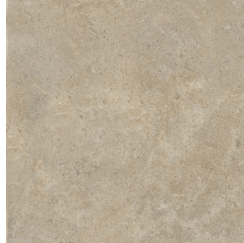
DMP9980R – Ecreu 35.5" X 35.5" Sq.Ft.: $12.95 - Pc.: $112.92