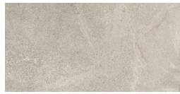
DMP340R – Cloud 11.75" X 23.5" Sq.Ft.: $8.95 Pc.: $17.18