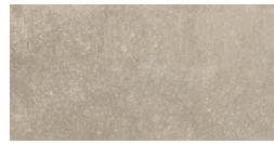
DMP380R – Ecreu 11.75" X 23.5" Sq.Ft.: $8.95 Pc.: $17.18