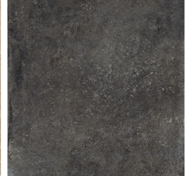
DMP9970R – Coal 35.5" X 35.5" Sq.Ft.: $12.95 - Pc.: $112.92