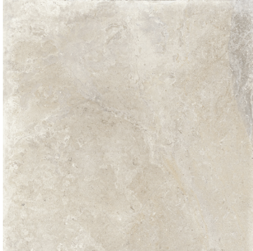
DMP9920R – Ivory 35.5" X 35.5" Sq.Ft.: $12.95 - Pc.: $112.92