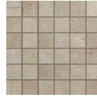
DMPM80R – Ecreu 2" X 2" mosaic 11.75" X 11.75" mesh Sq.Ft.: $28.95 - Pc.: $27.84