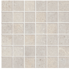
DMPM20R – Ivory 2" X 2" mosaic 11.75" X 11.75" mesh Sq.Ft.: $28.95 - Pc.: $27.84