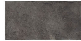
DMP370R – Coal 11.75" X 23.5" Sq.Ft.: $8.95 Pc.: $17.18