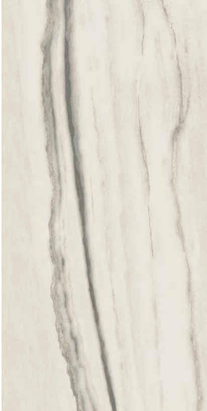
MRPWF63126P6 – White Fantasy Polished 63" x 126" Sq.Ft: $36.95 – Pc: $2,036.31