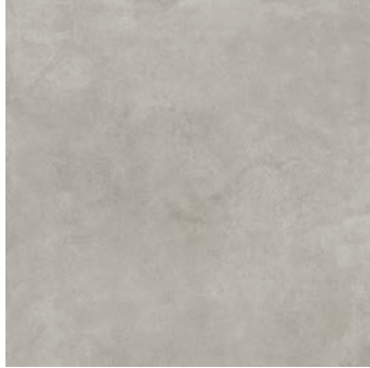
FKT603R - fog 24" x 24" natural Sq.Ft.: $12.95 - Pc.: $50.89