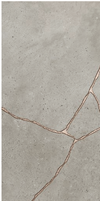
FKT623R - hibi fog 24" x 48" Sq.Ft.: $16.95 - Pc.: $133.23