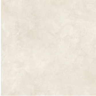
FKT601R - moonlight 24" x 24" natural Sq.Ft.: $12.95 - Pc.: $50.89