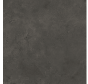
FKT600R - darkness 24" X 24" natural Sq.Ft.: $12.95 - Pc.: $50.89