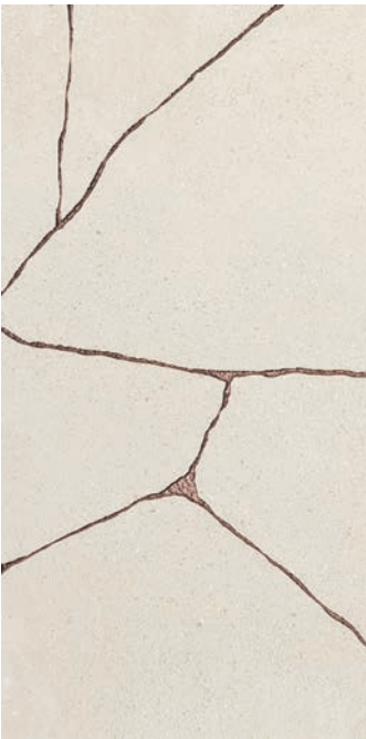
FKT621R - hibi moonlight 24" x 48" Sq.Ft.: $16.95 - Pc.: $133.23