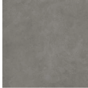
FKT607R - storm 24" x 24" natural Sq.Ft.: $12.95 - Pc.: $50.89