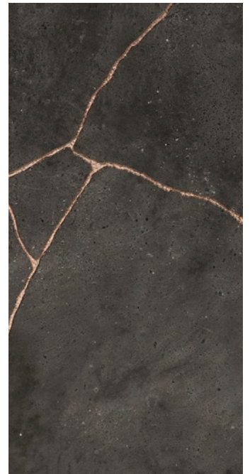
FKT620R - hibi darkness 24" X 48" Sq.Ft.: $16.95 - Pc.: $133.23