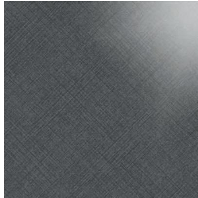
HAGR24 - Graphite 23.75" X 23.75" Sq.Ft.: $10.95 Pc.: $42.92