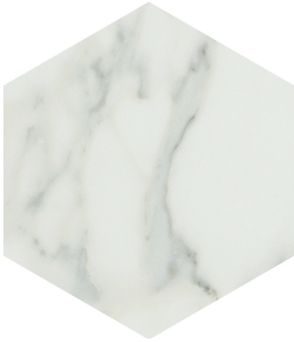
TCOWHEX - white 8" X 9.5" Sq. Ft.: $10.95 - Pc: $4.93