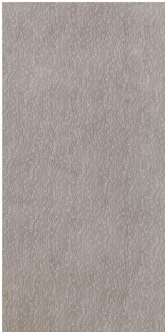
CNY2448N – New York 24" X 48" Sq.Ft.: $10.95 – PC.: $85.74