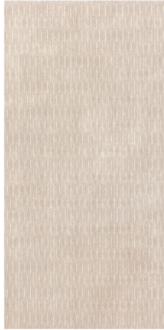
CLO2448N – London 24" X 48" Sq.Ft.: $10.95 – PC.: $85.74