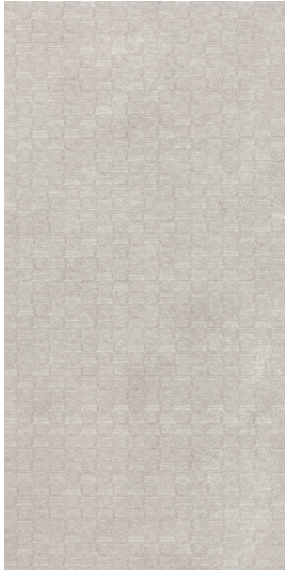
CSH2448N – Shanghai 24" X 48" Sq.Ft.: $10.95 – PC.: $85.74