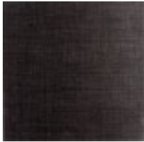
MNBL20 - Black 19.5" x 19.5" Sq.Ft: $10.95 - Pc: $28.91