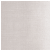
MNSI20 - Silver 19.5" x 19.5" Sq.Ft: $10.95 - Pc: $28.91